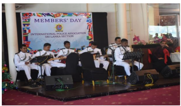
Sri Lanka Police Band

This event was attended by a large number of members of the section, and the day's programme covered several events of fun and games, followed by a fellowship grand lunch and an opportunity for them to relish the day.