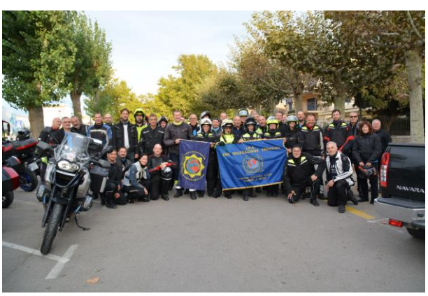
Ready for departure!

The route details were explained in an evening briefing, and new groups were quickly formed with people who had travelled on their own. It was brilliant to see new friendships form as everybody enjoyed dinner at the hotel.