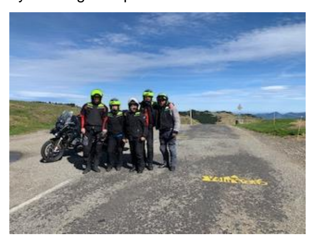
Summitting el Col de Pailhères

We departed in the morning from a nearby car park, where local police had helped us by booking the space.